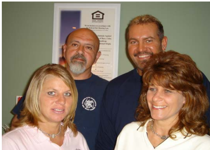
Harbor Club South's Management Team